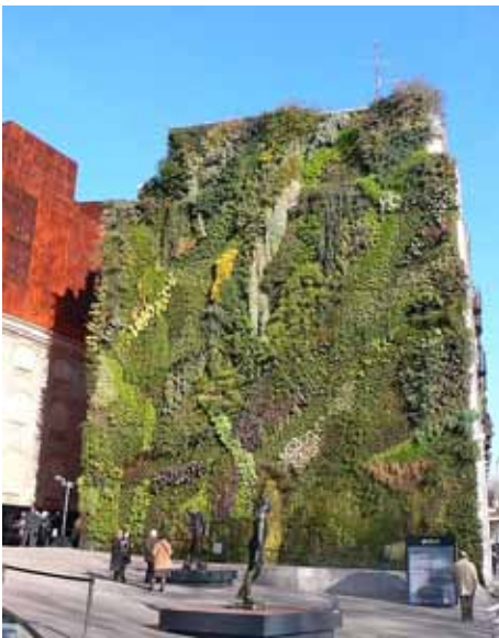
Structural Media System

Structural Media are blocks that incorporate the best features of the previously mentioned systems, into a modular, custom sized system. Longevity of plantings is in the range of 10-15 years, and each of the environmental factors - pH, water and nutrient demands - can be controlled to a much higher