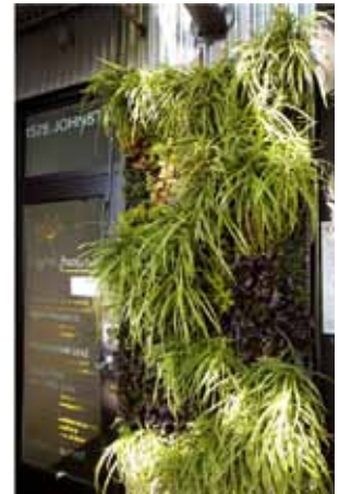
Loose Medium System

exterior applications, while interior installations can be done every two years. These systems are not recommended in locations with higher risks of seismic activity. They are also prone to accelerated erosion, and interactions with the public exacerbate this. This system is best suited to installations in private buildings where higher maintenance has been planned for.