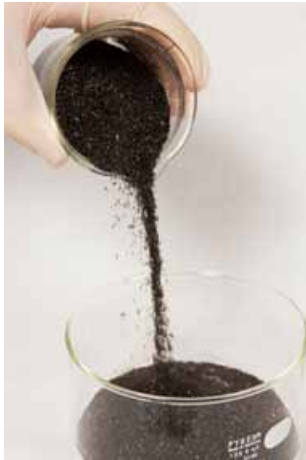
Test material is a glassy black slag before grinding for use in concrete.