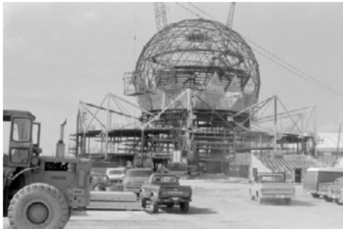
Construction of Expo Centre Vancouver British Columbia September 1984