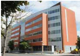
A 6-storey glulam post-and-beam structure with reinforced concrete cores in Quebec City, Quebec.

Reprinted with permission from the National Research Council Institute for Research in Construction www.nrc-cnrc.gc.ca/irc