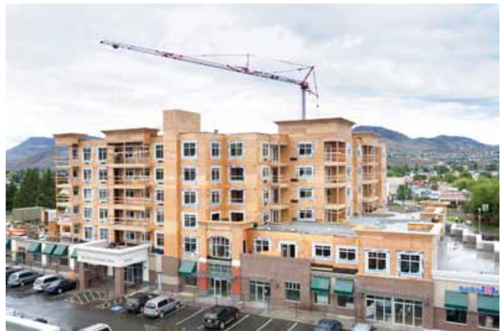
Five-storey wood-frame construction in Library Square in Kamloops, BC.

University Partners: University of New Brunswick McGill University Université Laval University of Quebec at Abitibi-Témiscamingue University of Ottawa Carleton University University of Toronto Ryerson University University of Waterloo University of Western Ontario University of British Columbia